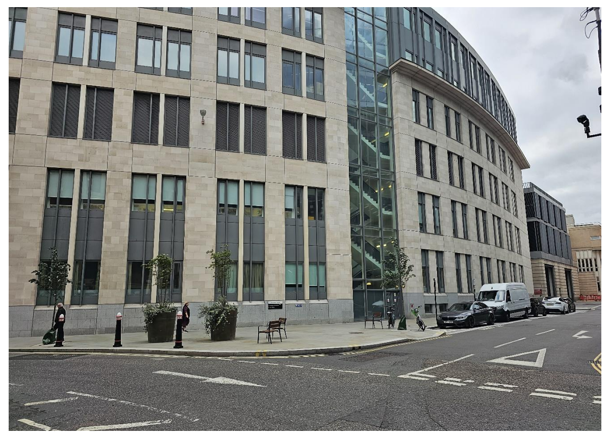
Phase 1 Area: Completed | Little Britain looking north from Montague Street