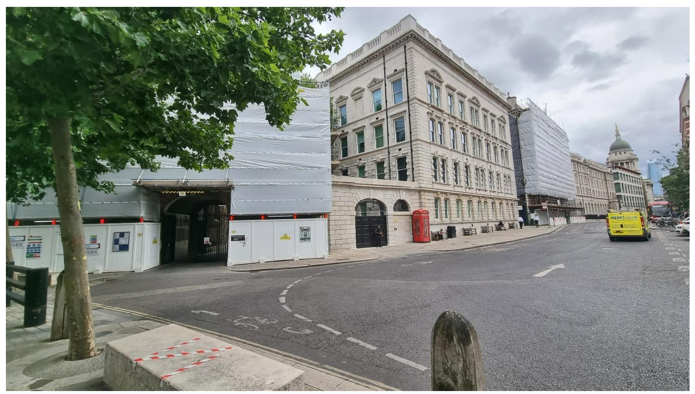
Phase 2 Area: Recap of West Smithfield/Giltspur Street circa July 2022