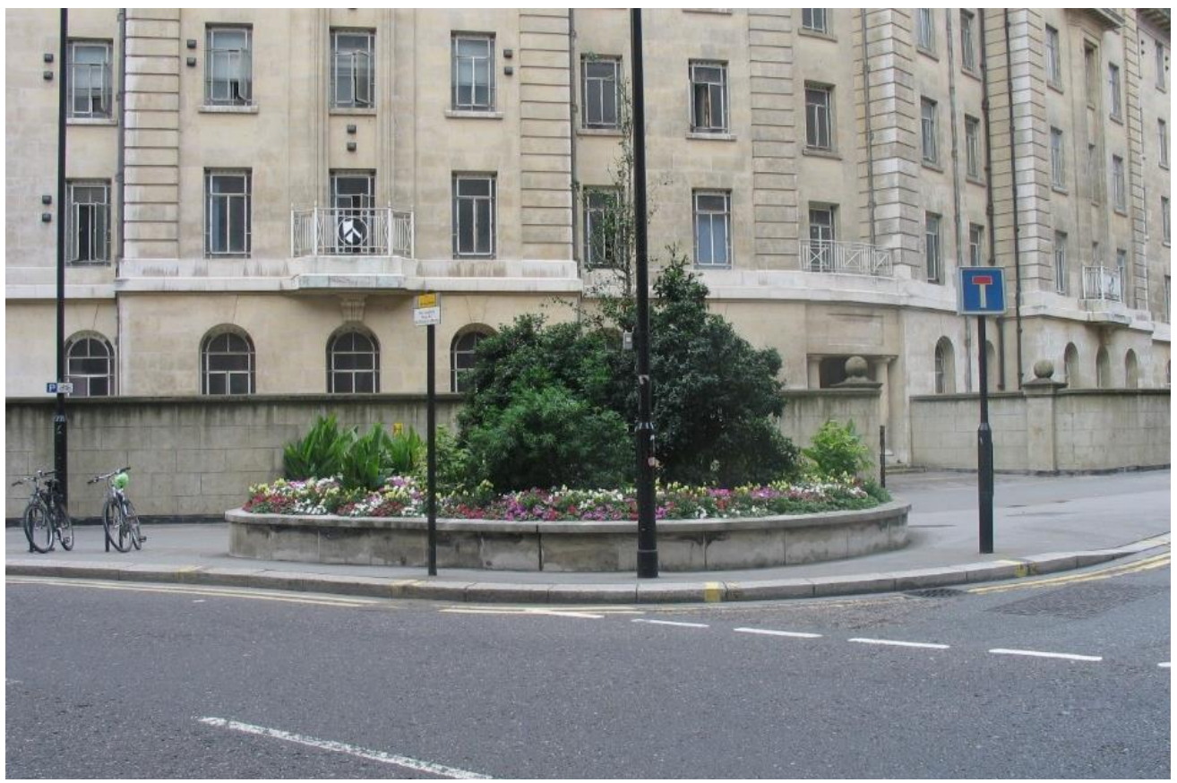
Phase 1 Area: Little Britain looking northwest from Montague Street Circa 2004